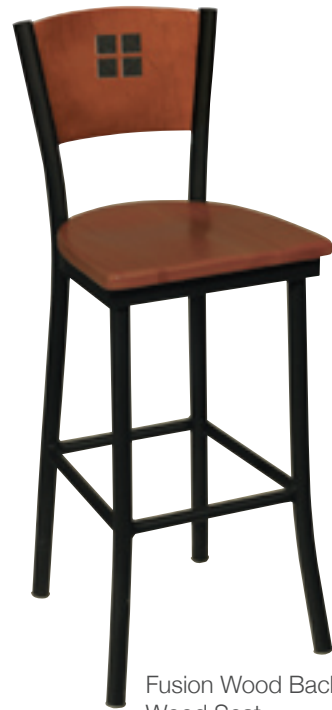
Fusion Wood Back Stool: Wood Seat