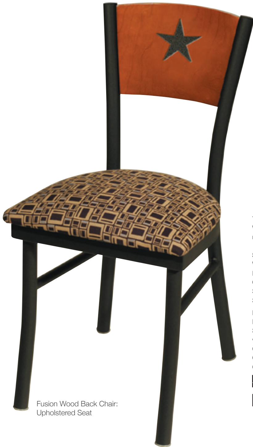
Fusion Wood Back Chair: Upholstered Seat