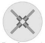
Four Centered Legs