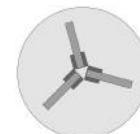
Three Centered Legs

Price shown is for single bases, multiply by number of bases needed.