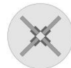
Four Centered Legs