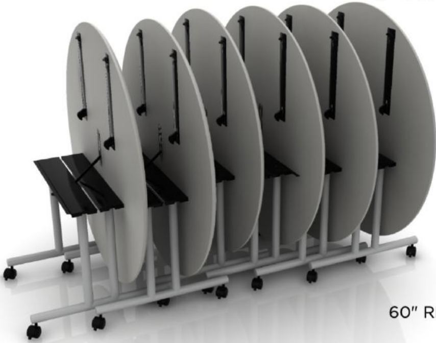
60" RD Nesting Footprint

This design is not intended for construction purposes. All room dimensions or plans are provided by the Dealership or Design Firm and are not the responsibility of FurnitureLab. All designs should be reviewed by the Designer to ensure that specifications meet the end user's expectations.