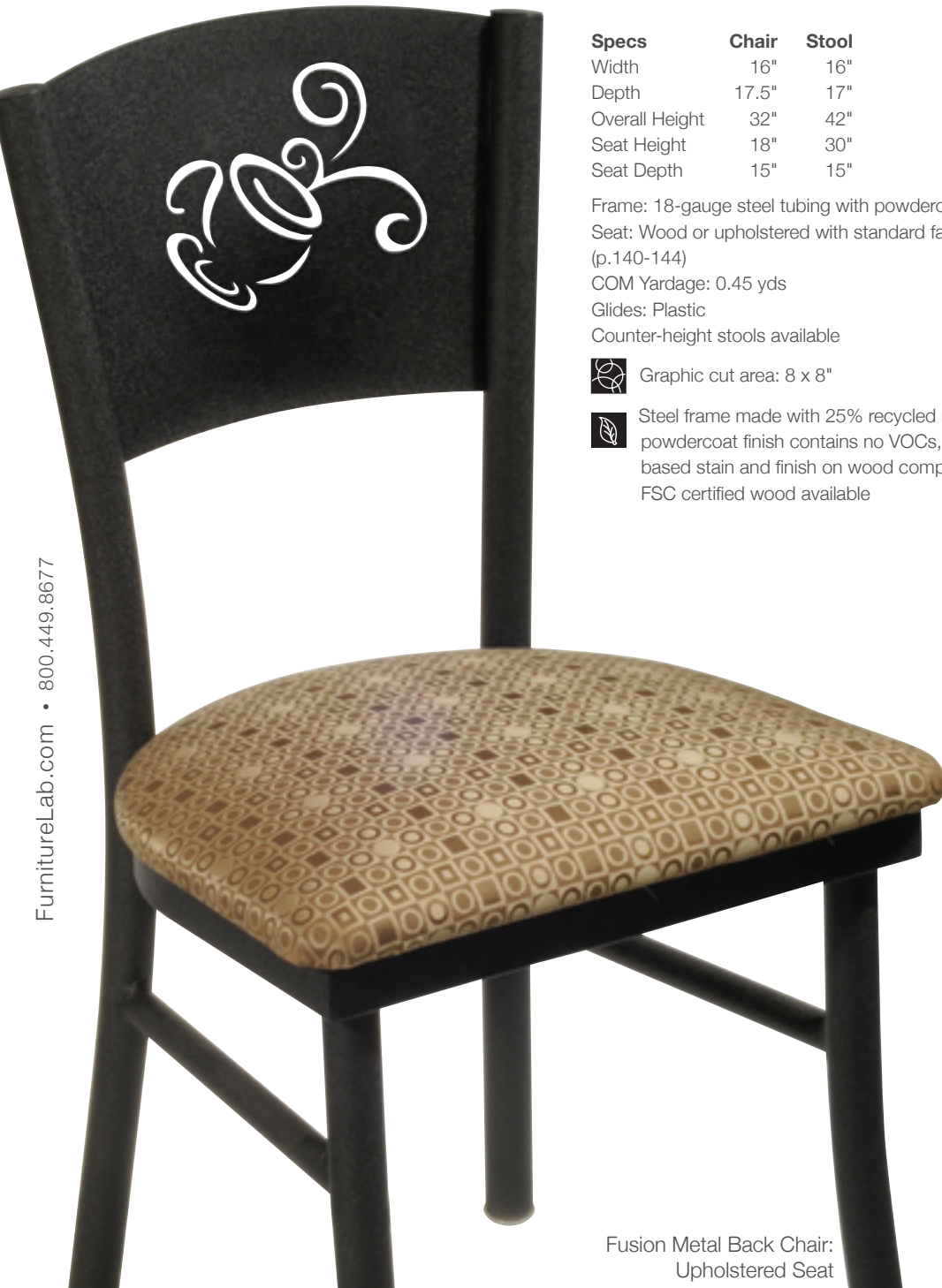
Fusion Metal Back Chair: Upholstered Seat