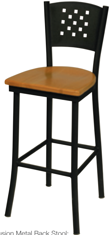
Fusion Metal Back Stool: Wood Seat