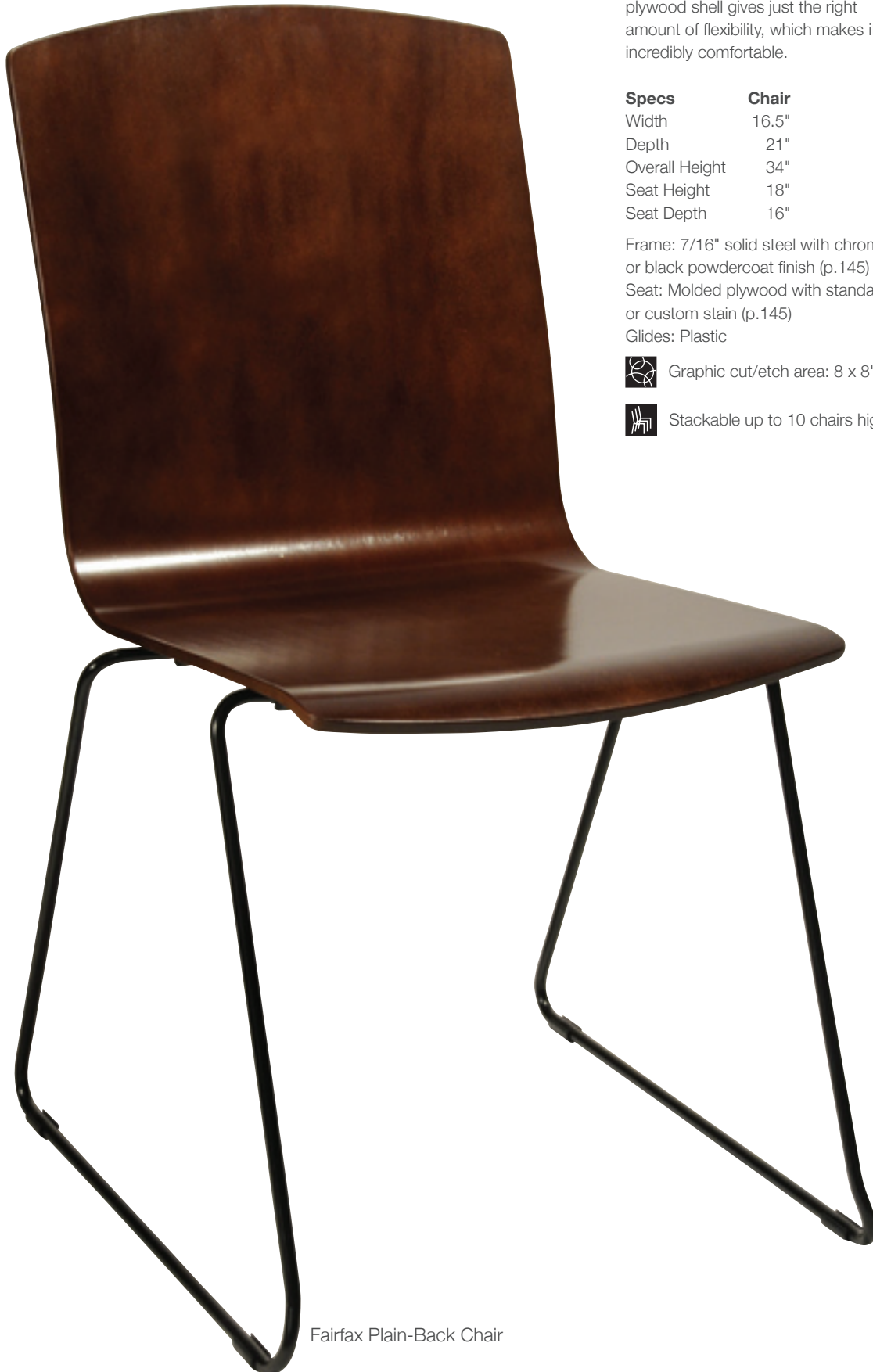
Fairfax Plain-Back Chair