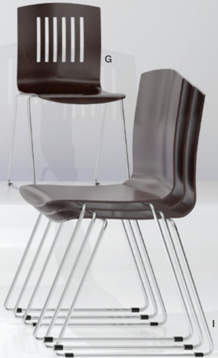
G. Fairfax Chair: Vertical Channels I. Fairfax Chair: Plain