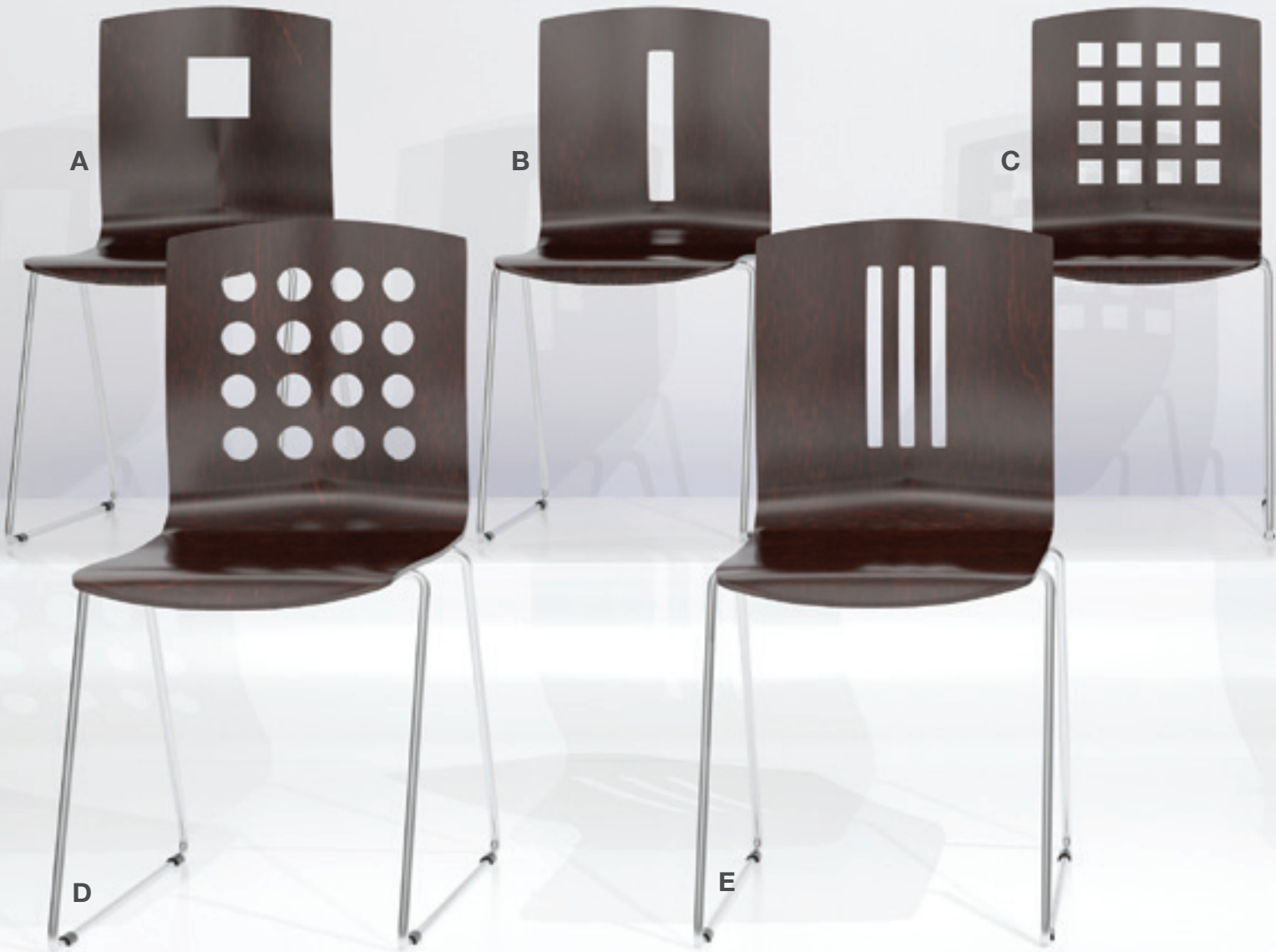
A. Fairfax Chair: Single Square D. Fairfax Chair: Dots