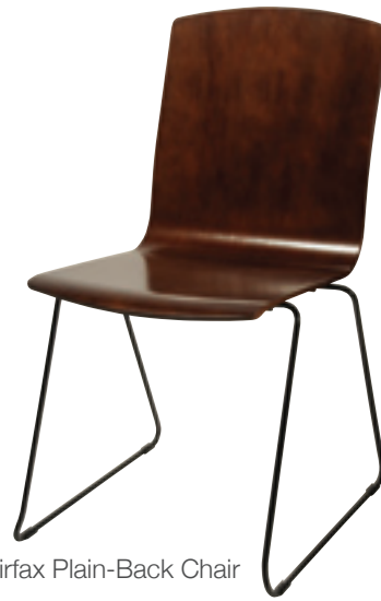
Fairfax Plain-Back Chair