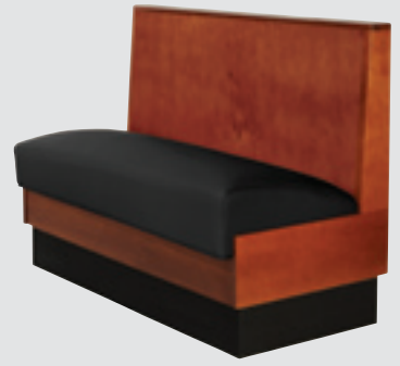
Titan Wood Back, Upholstered Seat