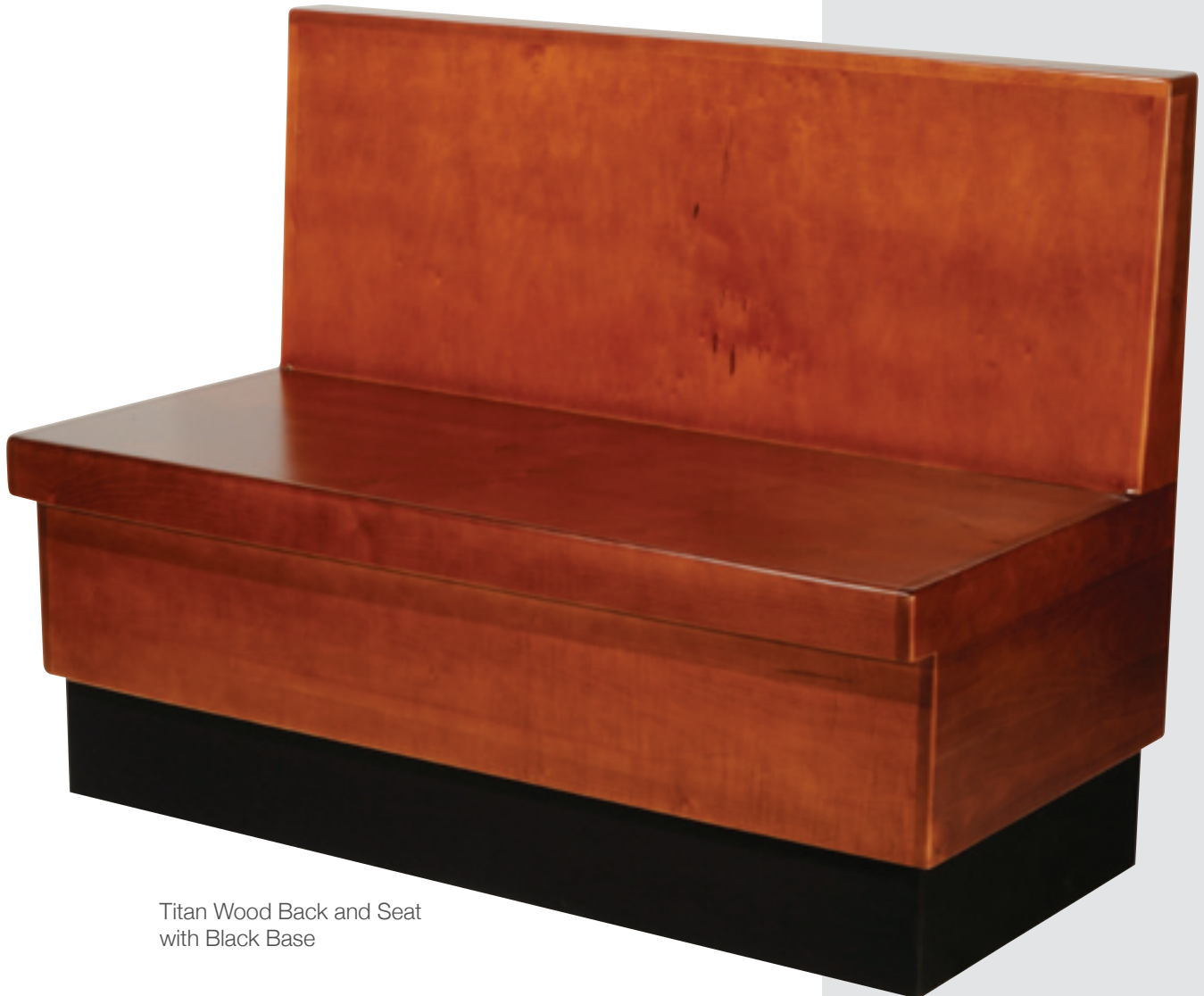
Titan Wood Back and Seat with Black Base