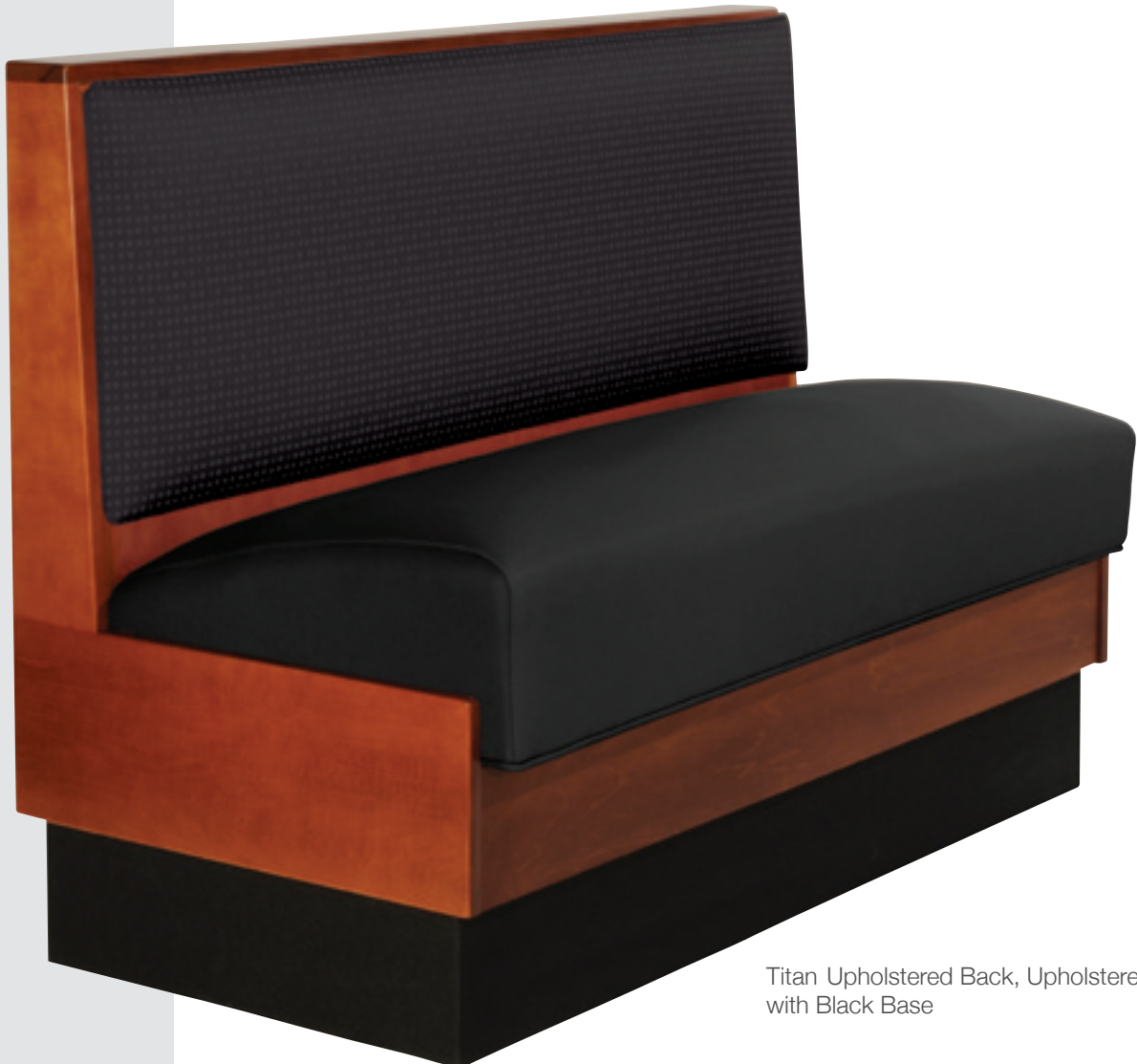
Titan Upholstered Back, Upholstered Seat with Black Base