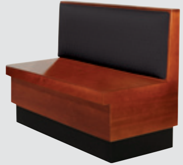
Titan Upholstered Back, Wood Seat