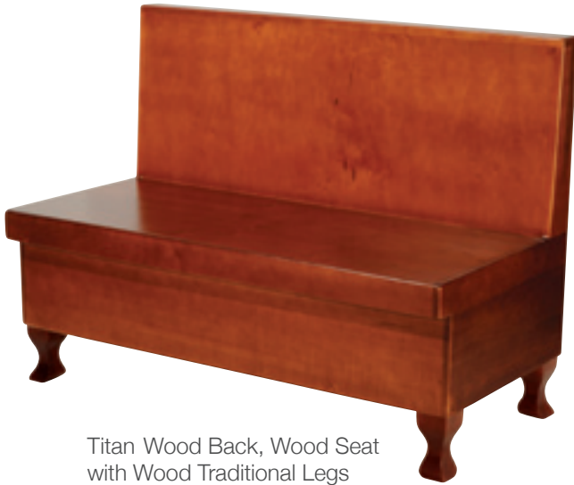
Titan Wood Back, Wood Seat with Wood Traditional Legs